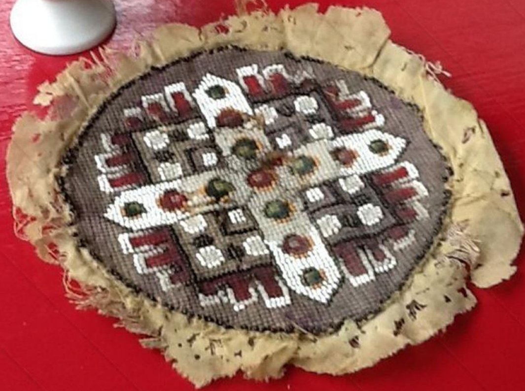
Front of embroidery