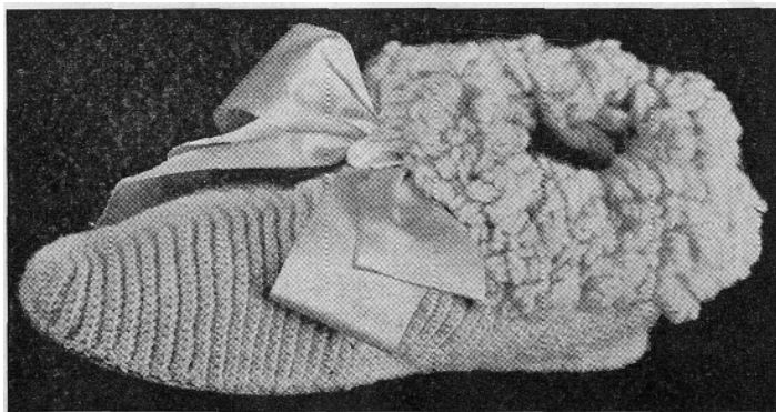
Crocheted House Slipper by Mrs. Nora Thompson

For ruching: Have 3 strands of yarn, insert hook in work, over 4 times, pull through, and repeat in each stitch, pulling the loops out about three-fourths inch, and always taking yarn next to you to next stitch; make this for bottom of beading, as well, and the latter will be entirely covered. Run an elastic band or tape in the beading, between the 2 triple trebles, and make a bow of ribbon for instep of the same shade as the yarn.