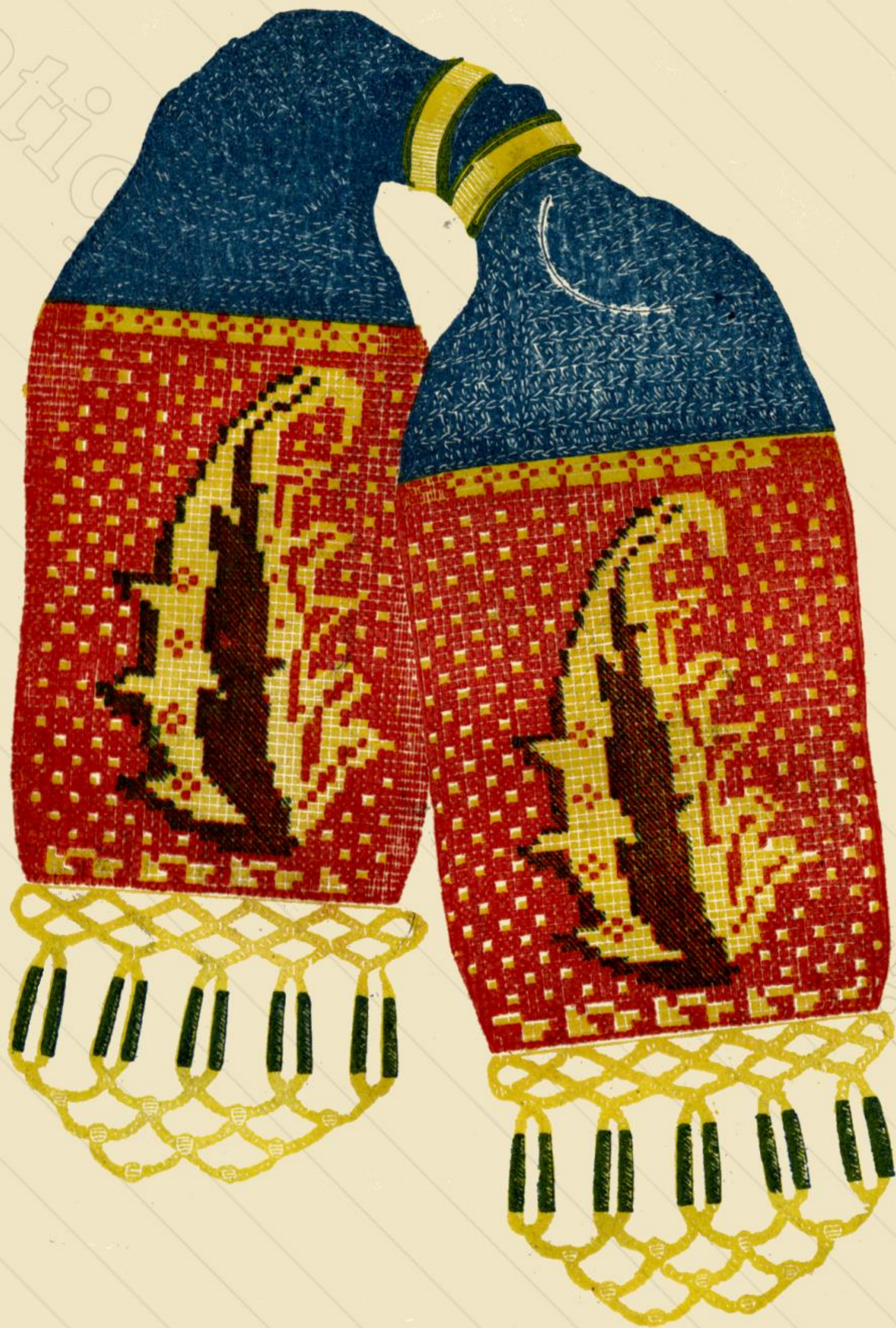
PURSE IN CHROCHET.