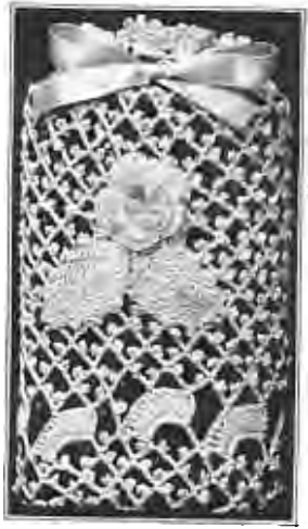
Cover for Talcum Powder Box in Irish Crochet No. 465b

Rose for Center: Ch. 6, join in a ring, (ch. 3, s.c. in the ring) 6 times. 2d row: (S.c., 4 d.c., s.c.) in each 6 ch. of 1st row. 3d row: Catch under beginning of first petal by sl.st., ch. 4, sl.st. before next petal until 6 loops are made. 4th row: Fill each ch. with (s.c., 6 d.c., s.c.). 5th row: Ch. 5 and fasten as in 3d row 6 times. 6th row: Fill each ch. with (s.c., 8 d.c., s.c.). 7th row: Ch. 6 and fasten as in 3d row 6 times. 8th row: Fill each ch. with (s.c., 10 d.c., s.c.). 9th row: Sl.st. to center of petal, ch. 7, sl.st. between 2 petals, ch. 7, sl.st. in center of next petal and repeat around. 10th row: 8 s.c. in each 7 ch. 11th row: Ch. 7, catch back in 5th for a p., ch. 7, catch back for p., ch. 2, s.c. in center of 8 s.c., and repeat around. 12th row: Same as 11th row, catching between picots of 11th row. 13th row: Sl.st. to