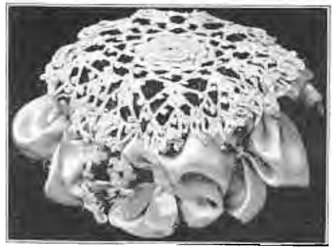
Pincushion Cover in Irish Crochet No. 465a

between 2 picots, ch. 3 to take the place of d.c., 2 d.c., ch. 2, 3 d.c. in same place, thus forming a shell, ch. 7, p., ch. 7, p., ch. 2; repeat the shell in between next 2 picots and repeat around. 14th row: Same as the 13th row. 15th row: Same as the 11th row, catching in 2 ch. of shells. 16th row: Ch. 11, catch back in 7th for p., ch. 4, catch back for p. in same place, ch. 6, sl.st. between 2 picots and repeat, making sl.st. in each sl.st. of last row and between every 2 picots.