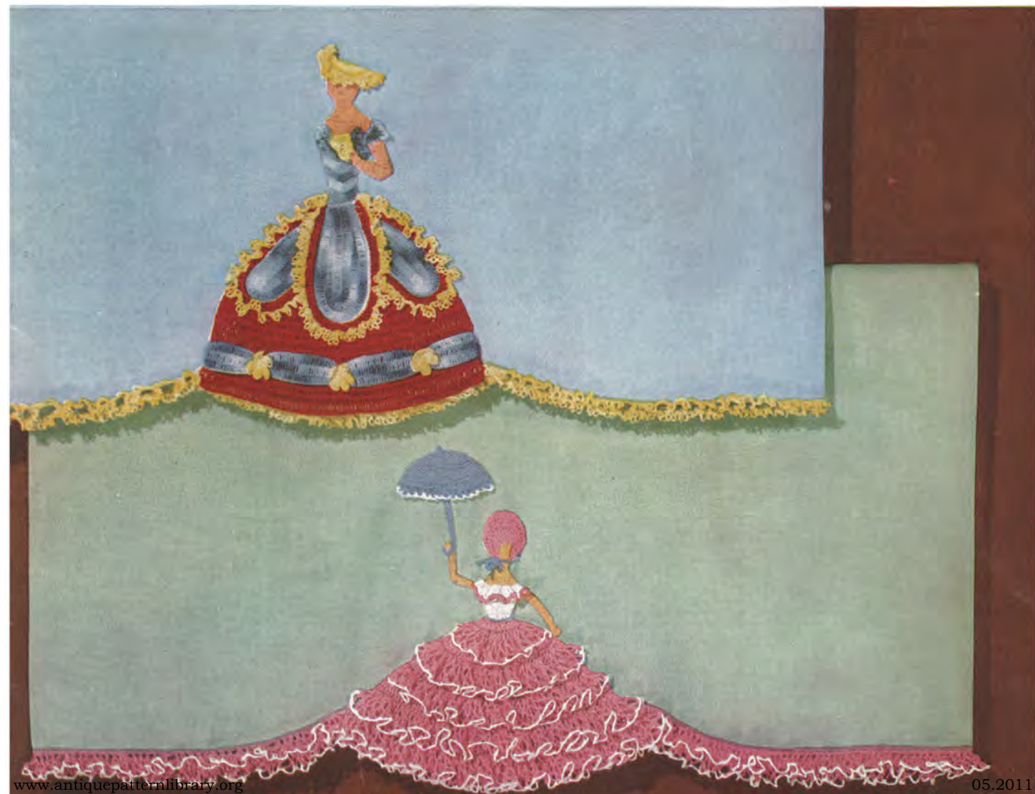
Bottom: CL-264—Directions on page 2