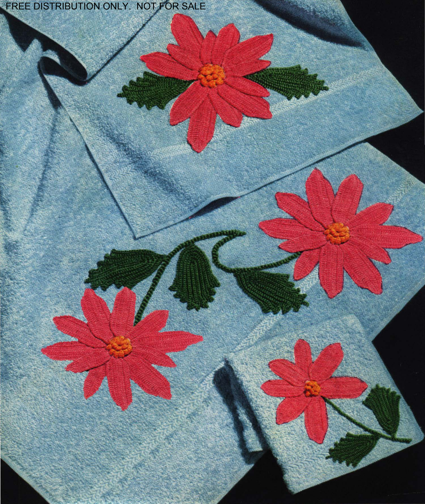
POINSETTIA BATH SET TW-354 . . . Page 4

NOTE: Illustrations are reproduced as faithfully as color printing permits. For actual thread colors check our favorite art needlework counter. Buy at one time the required quantity of each color number.