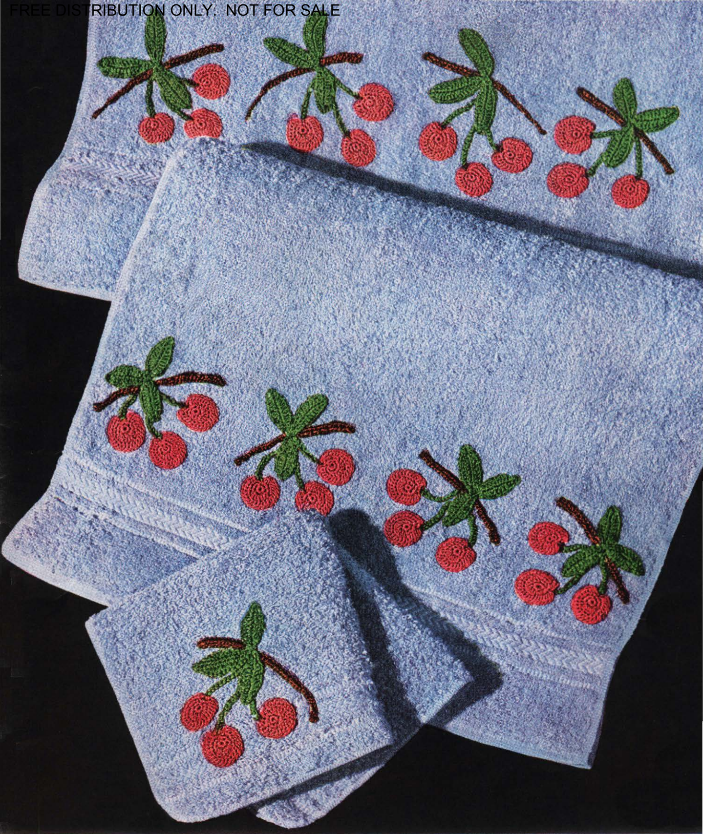
CHERRY BATH SET TW-355 . . . Directions on page 4

NOTE: Illustrations are reproduced as faithfully as color printing permits. For actual thread colors www.needlepointlibrary.org art needlework counter. Buy at one time the required quantity of each color number.