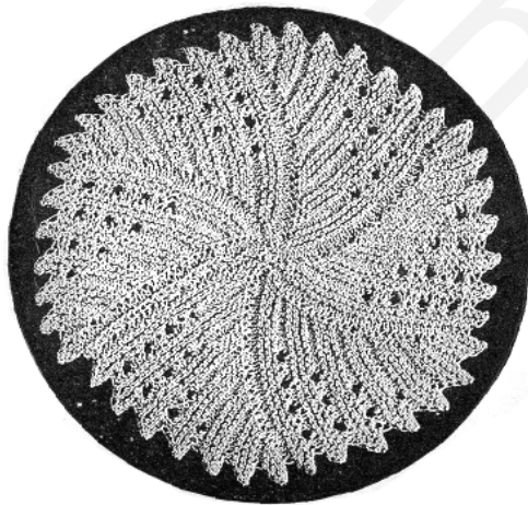
No. 2. By Mrs. E.J. Baker

28. Bind off 3, knit 29, turn, slip 1 and purl back. You now have the original number of stitches ready to begin the next gore. Having completed the requisite number of gores, so that the edges meet nicely, bind off rather loosely (to match the casting on), leaving a length of thread with which to sew the two edges together; If this is carefully done the joining will not be noticeable.