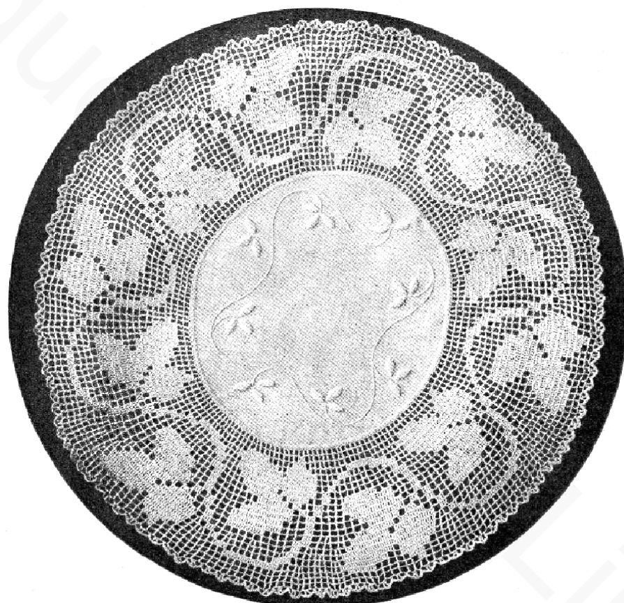
No. 1 The Clover-leaf Motif

The method of widening is not arbitrary; many workers prefer to make the extra spaces over the solid work, or trebles, because it is less noticeable missing but 1 treble between instead of 2. Simply have the border lie flat and smooth, and make the widenings uniform throughout.