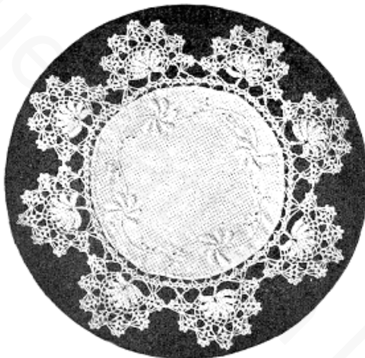
No. 3 In Madeira Embroidery Matching the Border

No. 4. (For Illustration See Page 12).—An especially pretty border has the star-motif, using No. 20 ecru thread, since the center is of tan linen. The embroidery is in padded satin-stitch, with golden-brown and green, the latter being used for the groups of leaflets around the outer edge, and for the circle which connects the motifs.